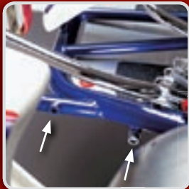
Unique short/long pedal mounting option