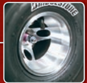
One-piece machined alloy 3 spoke wheels