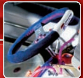
Flat top suede steering wheel with embroidered Arrow logo