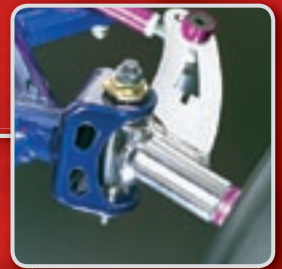
Adjustable camber/caster and Ackerman