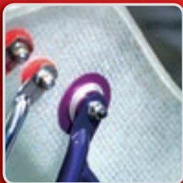
Arrow's unique self-centering seat washers