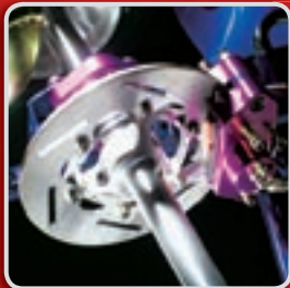
Slotted steel brake disc and 2 spot caliper