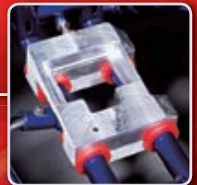
Arrow's unique anti-vibration engine mount

Due to constant development, specifications may change without notice