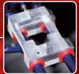
Arrow's unique anti-vibration engine mount