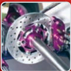
Ventilated 18mm wide brake disc and machined billet alloy two spot caliper