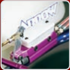
Machined billet alloy brake master cylinder