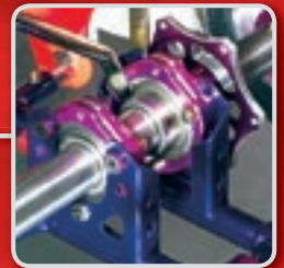
Rear axle supported by three bearings