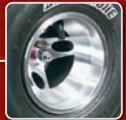
One-piece machined alloy 3 spoke wheels