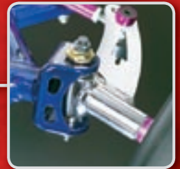
Adjustable camber/caster and Ackerman