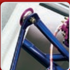
Arrow's unique self-centering seat washers