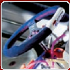
Flat top suede steering wheel with embroidered Arrow logo